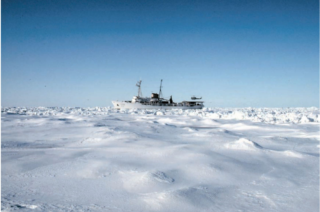
NOAA Ship SURVEYOR in the ice of the Bering Sea.