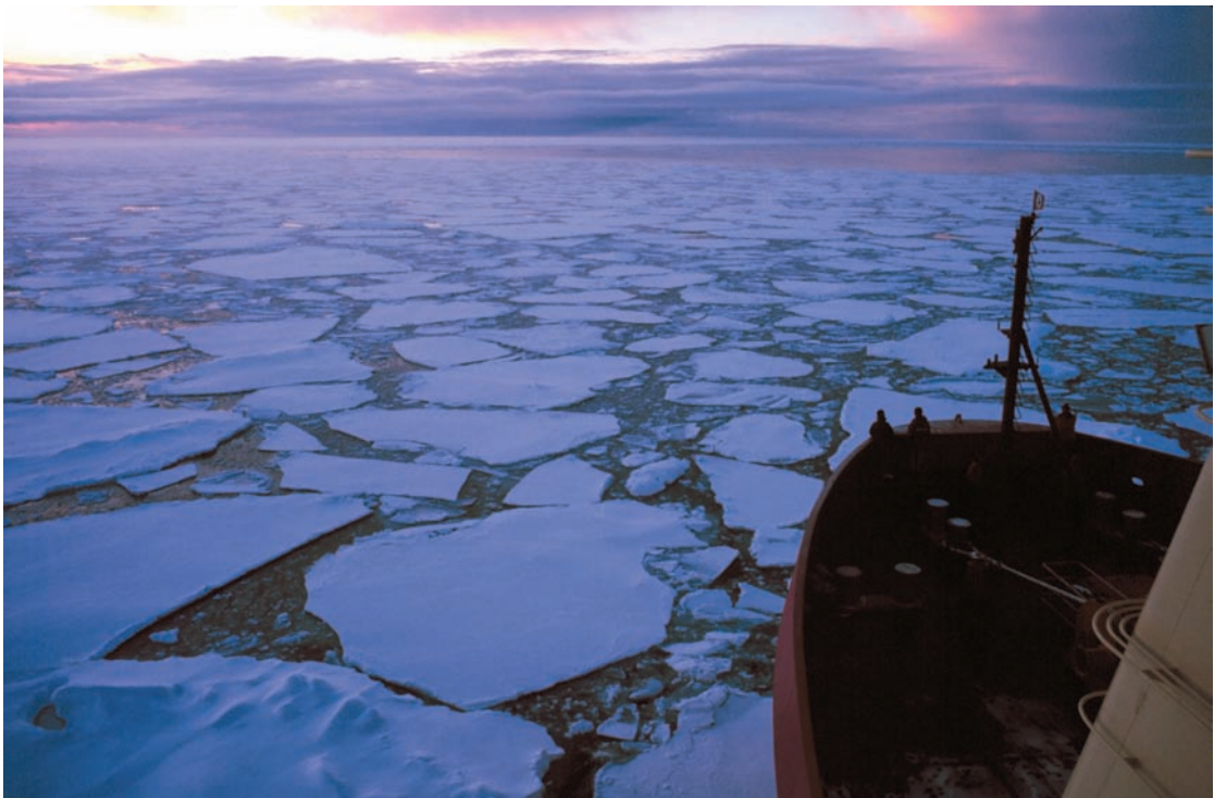
Sunset over sea ice.