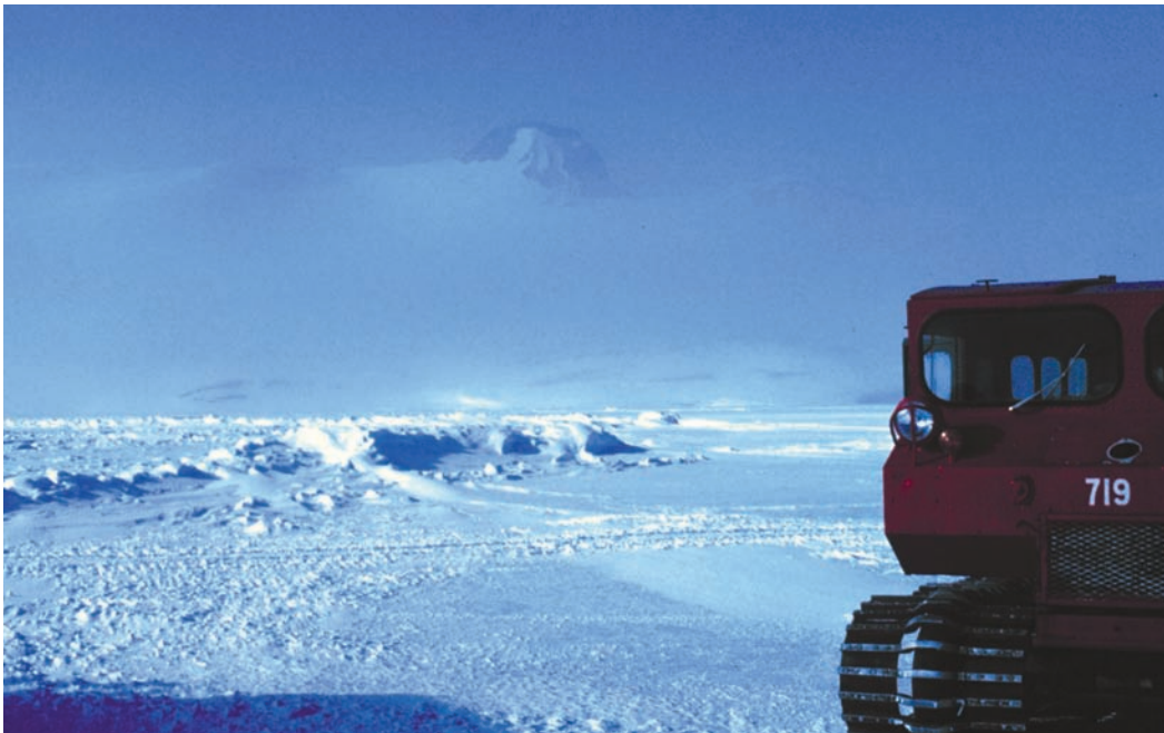
Antarctica. Castle Rock looms out of the fog. Tracked vehicle on the right.