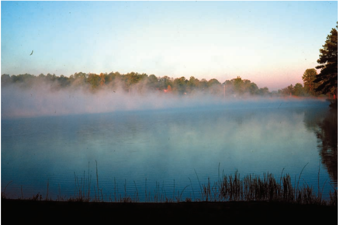
Early morning lake fog. Lake Carroll, Carrollton, Georgia.