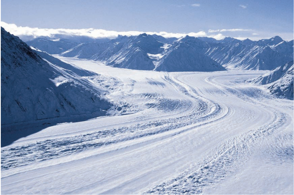
Aerial View of a Glacier.