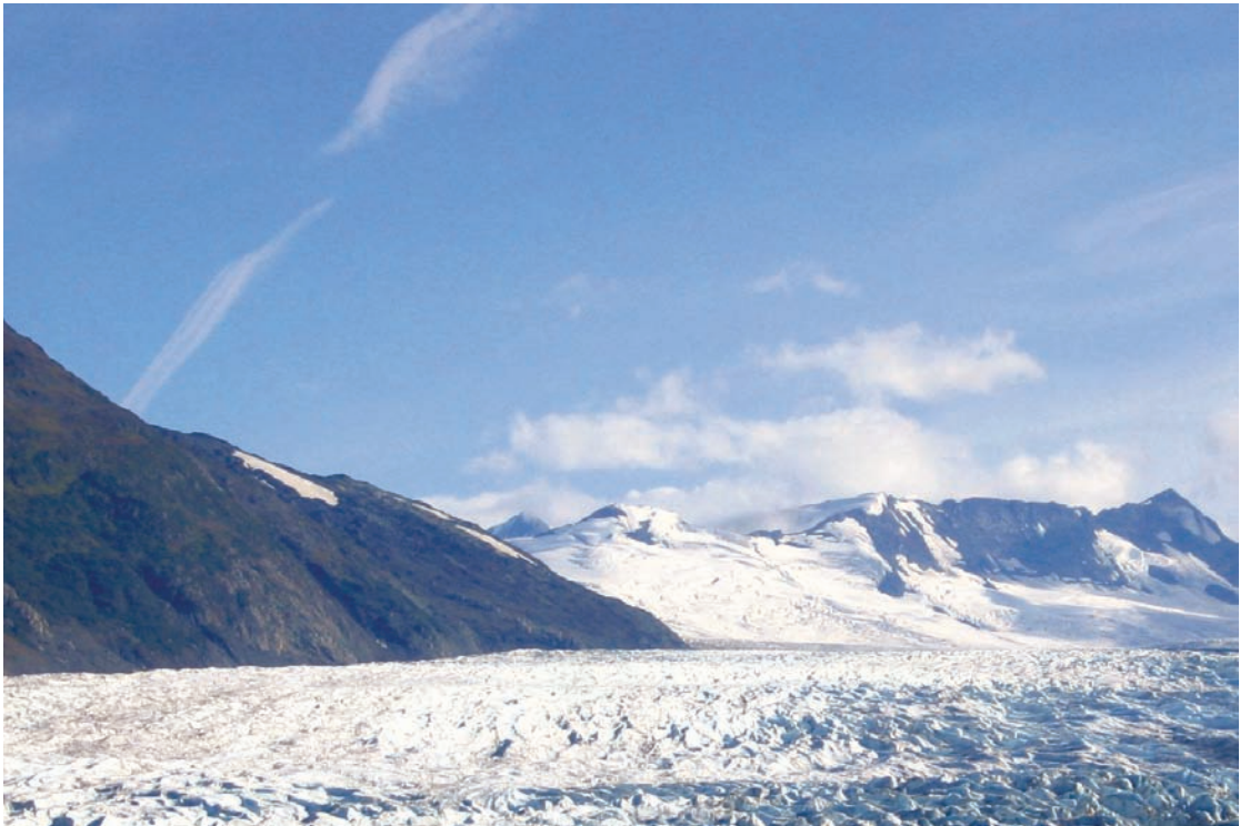
Spencer Glacier, Alaska.