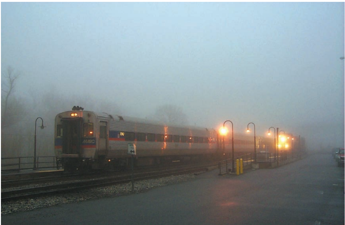
Train in the fog. Point of Rocks, Maryland.